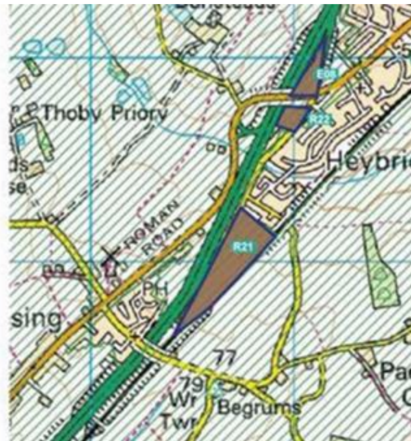
Image 2: Ingatestone & Fryerning Neighbourhood Plan Map extract from page 12